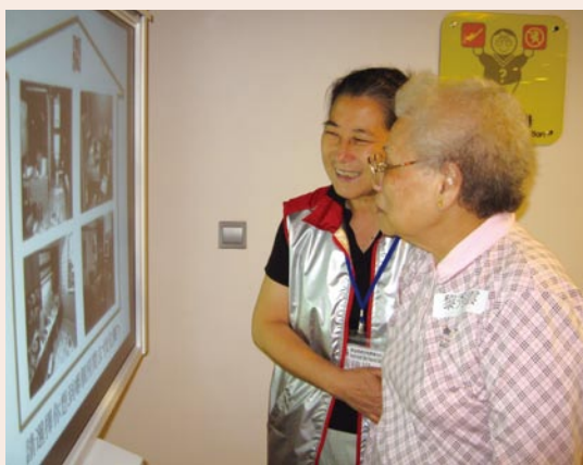
The elderly are intrigued by the assessment facilities of the ERC 長者對中心的測試設施甚感興趣