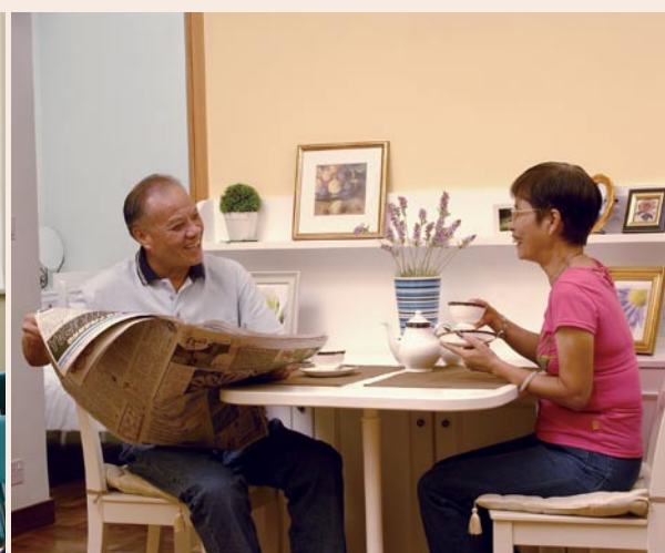
Elderly tenants enjoying leisure and an independent life style 長者住戶享受獨立開適的生活