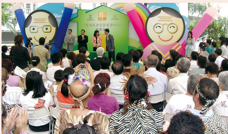
The opening of ERC attracted many visitors 「房協長者安居資源中心」開幕，場面熱鬧

中心亦成為長者護理從業員的資源中心，為老年保健從業員、護理和安全服務人員，以及須要照顧長者的家庭，提供一站式的老年護理信息和業界的最新發展資訊。「房協長者安居資源中心」自二零零五年七月啟用至二零零六年三月底，接獲的查詢、預約及集體參觀活動超過一千二百五十宗，已接待的訪客包括約六千名長者及二千二百多名老年護理機構的從業員。