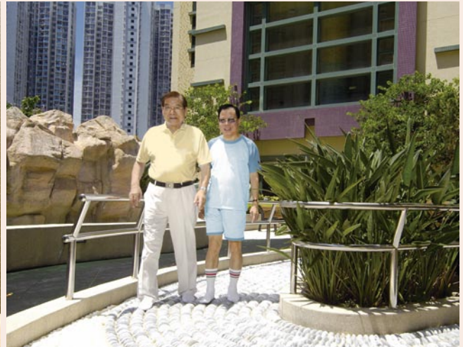
A wide range of facilities are available in the SEN estates for the elderly residents 「長者安居樂」屋苑設施齊備，長者各適其適

as well as elderly flats. In connection with this innovative development concept, a customer survey is being conducted to collect views on alternative development schemes, disposal arrangements and financial viabilities.