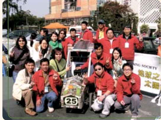
Participating in the Friends of the Earth’s Solar Cart Race 參加「地球之友的太陽能車大賽」