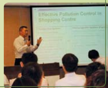
Environmental talk for shop tenants by the Environmental Protection Department 邀請環境保護署為商戶舉辦環保講座