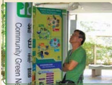
Environmental exhibition at estates 屋苑舉行環保展覽

HSC has developed a regular environmental programme for residents. Highly anticipated dates on our annual calendar include the Tree Planting Day and Walk for the Environment with The Conservancy. Moreover, we regularly schedule environmental outings, carnivals, visits to the nature education centre and environmental forums. As most of these activities take place in the countryside, they provide a chance for participants to appreciate Hong Kong's natural beauty and thus underscore the importance of environmental protection.