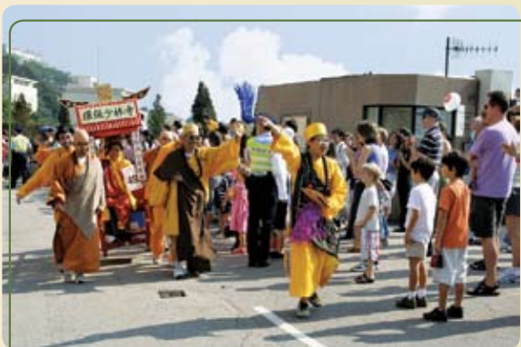
Promoting environmental protection in the Matilda Sedan Chair Race 在「明德抬轎籌款比賽」中推廣環保訊息

In addition, we always make use of every opportunity to promote environmental awareness. For instance, the theme of a "Green Shaolin Temple" was adopted in the "Matilda Sedan Chair Race 2006" to promote environmental messages.