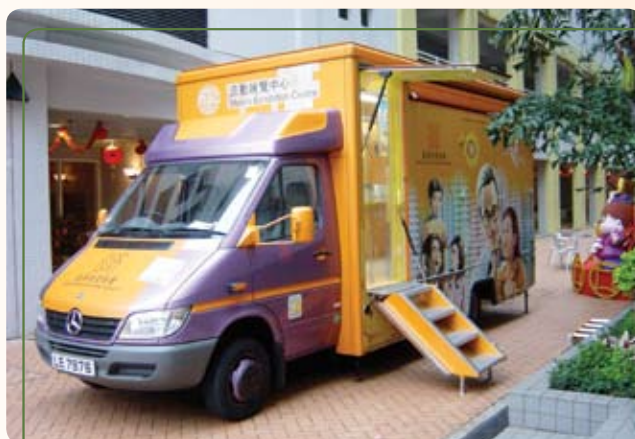
Mobile exhibition centre 流動展覽中心

The Mobile Exhibition Centre, a specially-designed LPG powered truck in compliance with Euro-4 Exhaust Emission Standard, showcases a range of environmentally-friendly fittings, including a solar-powered ventilation system and energy-saving compact fluorescent light bulbs. It also serves as a well-stocked mobile library, offering access to educational resources such as computers, audio-visual equipment and books.