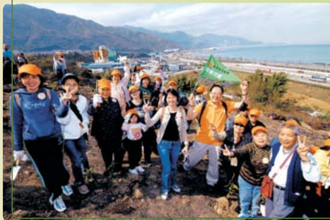
Residents taking part in the Hong Kong Tree Planting Day 居民參與「香港植樹日」

我們亦積極支持本地的慈善和綠色團體，參與多項植樹及籌款等活動，其中包括「綠色力量」舉辦的「環島行慈善行山比賽」以及「地球之友」的「太陽能車大賽」和「綠野先鋒植樹遠足挑戰賽」；我們亦參加「長春社」舉辦的「環保熱點大追蹤」，走訪香港的自然生態及文物古蹟的環保熱點；同時，我們自