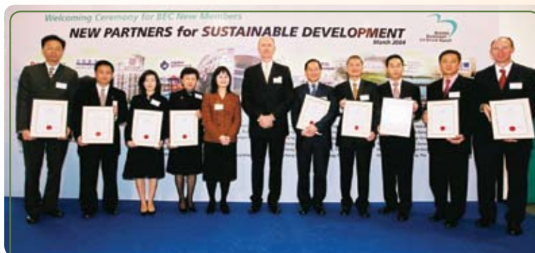
Joining the Business Environment Council to promote sustainable development 加入「商界環保協會」推廣可持續發展