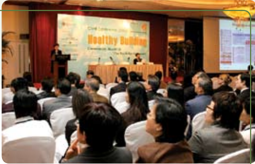
Sponsoring Healthy Building Conference 2005 of the Construction Industry Institute 贊助香港建造業研究學會舉辦的「2005健康樓宇會議」

The Housing Society is an active participant in environmental programmes targeted at the community and, in particular, the housing industry. Among them are the Conference on Healthy Buildings, organised by Construction Industry Institute – Hong Kong in 2005, and the associated publication “Research Findings on Healthy Buildings”; and the Professional Green Building Council’s Green Building Award in 2006. We have also supported the Business Environment Council’s EnviroSeries Conference for three consecutive years since 2004.