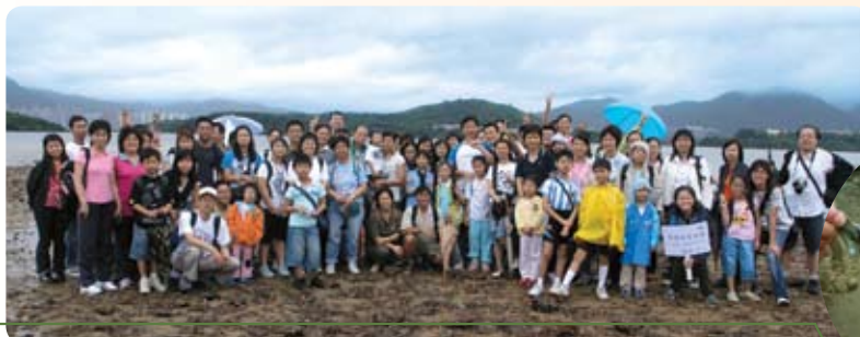
Environmental and ecological tours 環保及生態遊