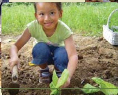
Environmental outing and tree planting 環保遊及植樹活動