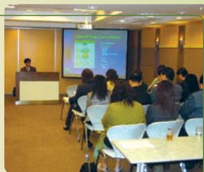
Briefing session for recycling of spent mercury lamps 水銀燈回收計劃簡介會

除了工作範圍外，我們的環保訓練更伸延至員工的日常生活。我們每年都會為員工及家人舉辦生態旅遊。近期活動包括參觀新界西堆填區、印洲塘、元朗和大埔的生態遊。此外，我們亦定期舉辦綠色常識問答比賽，提高保護環境的知識。