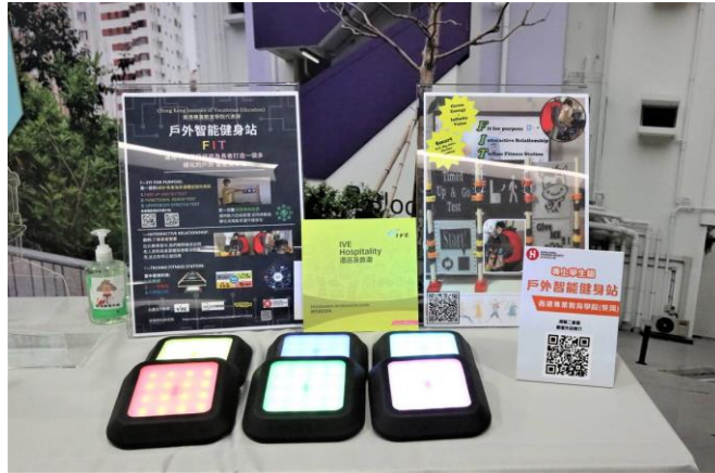
Gold Award (Tertiary Student Category) - Outdoor Smart Fitness Station (FIT)