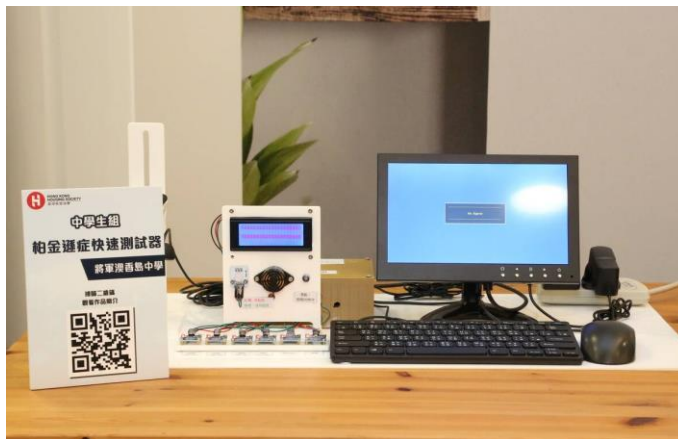
Silver Award (Secondary School Student Category) - Parkinson's Disease Teste