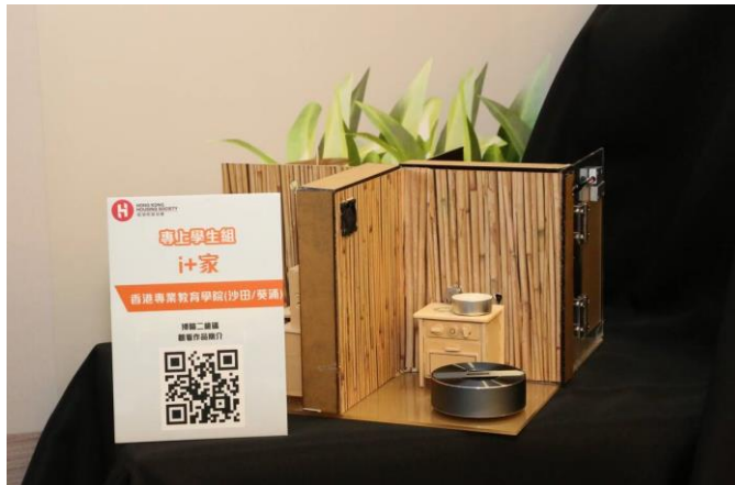
Silver Award (Tertiary Student Category) - i+home