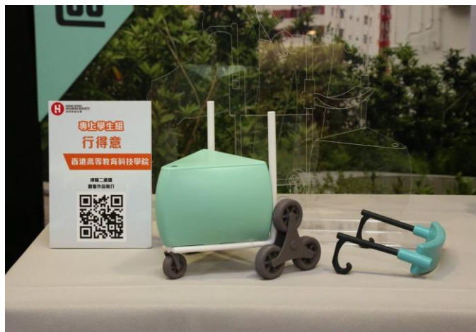
Bronze Award (Tertiary Student Category) - E-walker